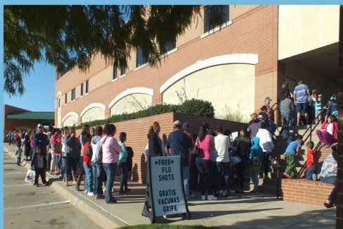
Attendees at the 2014 Carnival de Salud line up for free flu shots.