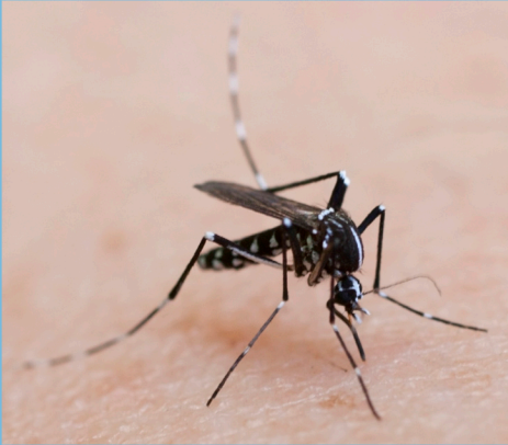
Asian tiger mosquito (Aedes albopictus)