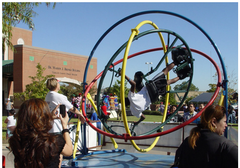
Human “gyro” ride at the Carnaval de Salud.

Carnaval would not be possible without the contribution of approximately 50 volunteers (many from the Tarrant County Medical Reserve Corps) who donated their expertise and time to make the 6th annual Carnaval a great success. Public Health sponsors Carnaval de Salud as part of its support for Binational Health Week, a collaborative effort on behalf of the Mexican Ministry of Health, the Mexican Consulate of Dallas and other local agencies that focus on health care and wellness among Hispanics. The goal of the week is to promote sustainable partnerships that address health problems in the United States, Mexico and Canada. The 7th annual Carnaval de Salud is scheduled for Saturday, Oct. 6, 2012.