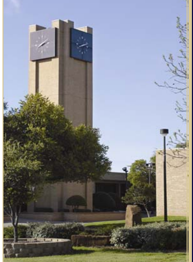
Tarrant County College Northeast Campus

If students are not quite ready to take college-level courses, they can brush up their skills in reading, writing, and math by taking developmental courses. Folks in the community who are interested in taking courses just for fun or to increase their skills in a certain area can do this through continuing education courses ranging from art and drawing to water aerobics. We teach little people in the summer in "College for Kids", as well as mature adults in the "Senior Ed Program". We have something for everyone at Tarrant County College Northeast. Visit us at www.tccd.edu.