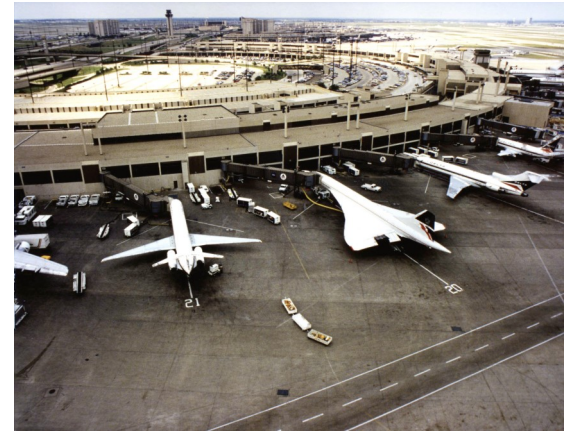
(1970's Supersonic Jet)

To read more visit: https://www.dfwairport.com/dfwnewsroom/golden-anniversary-dfw-airport-marks-50-years-of-serving-north-texas/