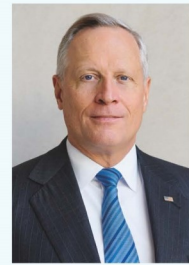
Ross Perot, Jr. Chairman The Perot Companies and Hillwood

This year's summit will explore growth throughout the region.