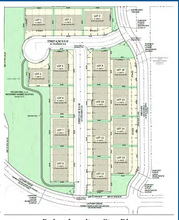
Baker Landing Site Plan

Redevelopment of Glenview Drive, a major artery of Northeast Tarrant County, will be a significant priority in the coming years. In partnership with Tarrant County, the City of Haltom City, and the City of North Richland Hills, the reconstruction of Glenview will include pavement resurfacing, new curb and gutters, drainage improvements, and new signalization. These improvements will provide a safer, more efficient, and reliable corridor that improves the connectivity and traffic flow in the Northeast Tarrant Region. In coordination with the reconstruction of the roadway, the City will also be creating a corridor master plan for Glenview – Drive to help define and encourage future redevelopment.