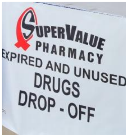
Super Value Pharmacy