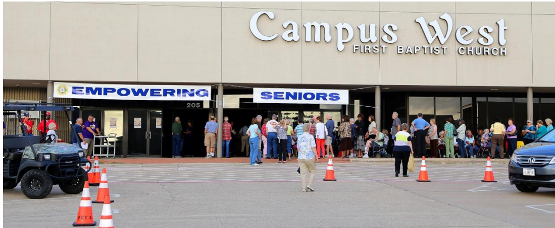
First Baptist Church, Euless – Campus West