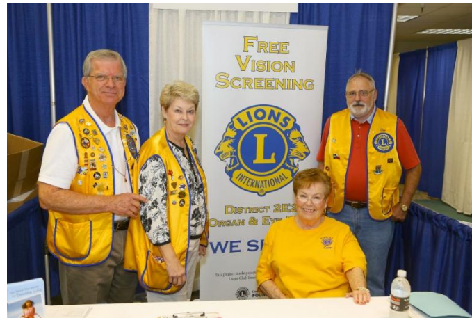
District 2E2 Lions – Lions Organ and Eye Bank