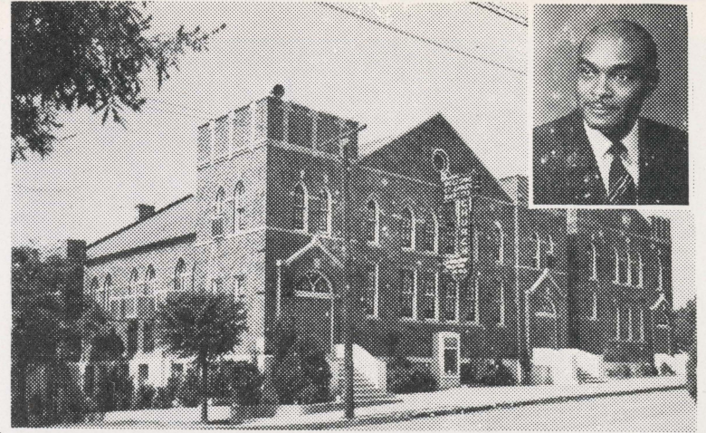
"STUDY TO SHEW THYSELF APPROVED UNTO GOD, A WORKMAN

THAT NEEDETH .... NOT TO BE ASHAMED, RIGHTLY DIVIDING