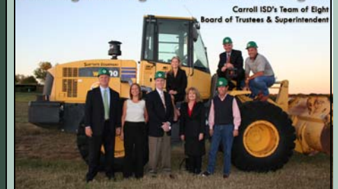
Board of Trustees and Superintendent at Groundbreaking

For more information, please visit our website at: www.southlakecarroll.edu