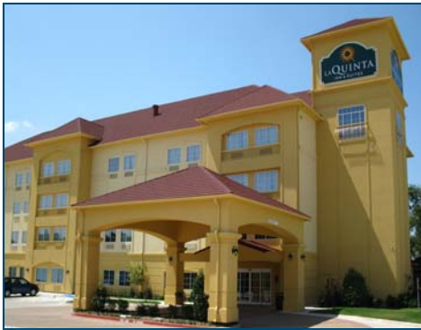
La Quinta Inn

R ichland Hills is a great place to do business, and 2009 was no exception. Some highlights from the last year include: - Hiring a full time economic development specialist - Establishing the Baker Boulevard Tax Increment Reinvestment Zone - Re-establishing the Storefront Improvement Program - Naming new members to the Richland Hills Development Corporation and Economic Development Advisory Board - Grand opening of the La Quinta Inn and Comforts Suites at Loop 820 and Glenview Drive