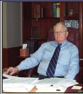
Tarrant County Criminal District Attorney