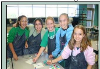
Intermediate students enjoy art class

Carroll ISD is a K-12 public school system located in the heart of the Dallas-Fort Worth Metroplex. The 21-square-mile district consists of 11 schools serving more than 7,750 students and 1,000 employees. The district is the largest in the state of