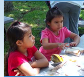
Local children enjoy a nutritious lunch at this summer's Feed Our Kids program.

The impact that GRACE has had on the community can be measured by the countless stories of families and individuals whose lives have been transformed. However, none of these stories would have been possible had it not been for the generosity of this community. Each year, the people of northeast Tarrant County donate their talent, their time or their treasure to support the GRACE mission. The challenge facing GRACE now is finding the resources to keep pace with an increase in need. This year, GRACE has seen as much as a 40% increase in requests for services.