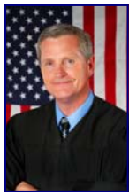
Judge Ralph Swearingin, Jr. Justice of the Peace Precinct 1