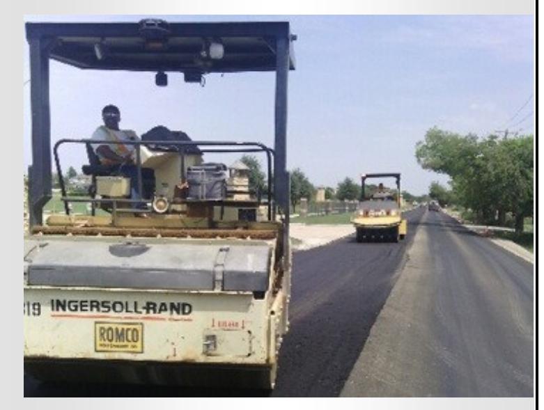
Article courtesy of Richard Schiller

Avondale Haslet Road Blue Mound Road Blue Prairie Trail Bonds Ranch Road Comanche Moon Drive Haslet Roanoke Road (scheduled for September 2014) Hicks Avondale School Road Prairie Ridge Trail Purple Sage Court Purple Sage Court