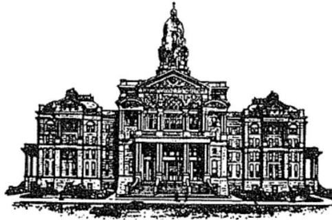
Tarrant County 1895 Courthouse