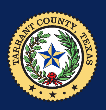
May 31, 2022